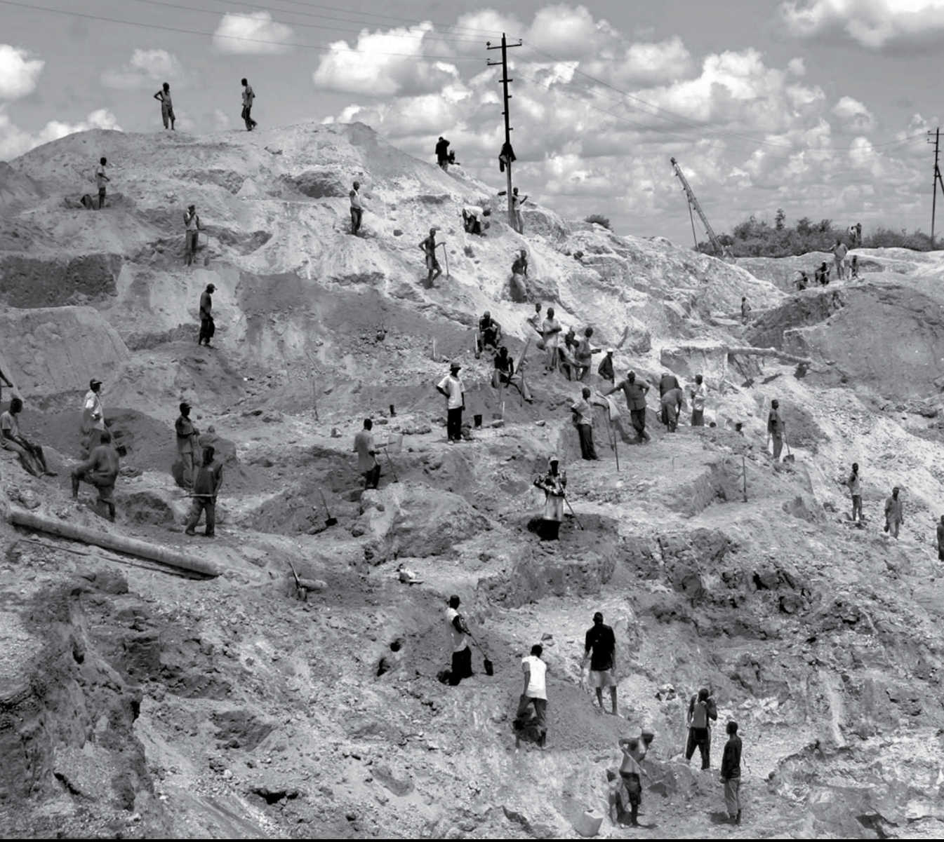
Freelance miners dig in an open-pit mine just outside the southern Democratic Republic of Congo copper town of Lubumbashi

The even worse news for African manufacturing is the degree to which it is dominated by small, informal (i.e., underground) firms that are not particularly productive.