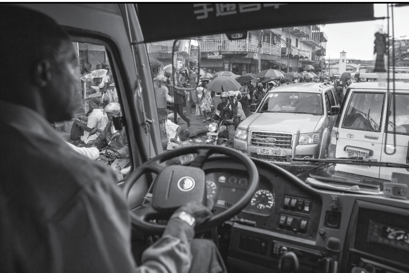
A bus driver navigates the congested streets of Freetown, Sierra Leone

trializing. In the post-World War II period, there were two such waves – one on the European periphery (Spain, Portugal and Italy), the other in Asia (Korea, Taiwan and China). Very few countries have enjoyed rapid, sustained growth based on natural resources, and those that did were typically very small countries in unusual circumstances. Three of these countries were in sub-Saharan Africa: Botswana, Cape Verde and Equatorial Guinea. These cases demonstrate that it is, indeed, possible to grow rapidly if you are exceptionally rich in hard-rock minerals or fuels. But it would be a stretch of the imagination to think that these countries set a relevant example for countries such as Nigeria and Zambia, let alone Ethiopia and Kenya.