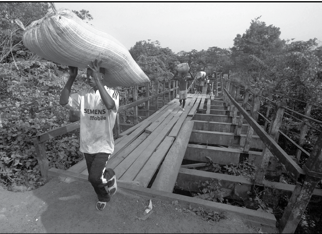
Bridge infrastructure, Ivory Coast into Liberia

Acemoglu and Robinson and their colleagues) attribute the bulk of country variation in long-run income levels to differences in institutional quality. But even if they are correct, this long-run relationship tells us rather less about growth prospects over the next decade or two. Empirically, the correlation between institutions (or the change in the quality thereof) and growth rates – as opposed to income levels – is not strong.